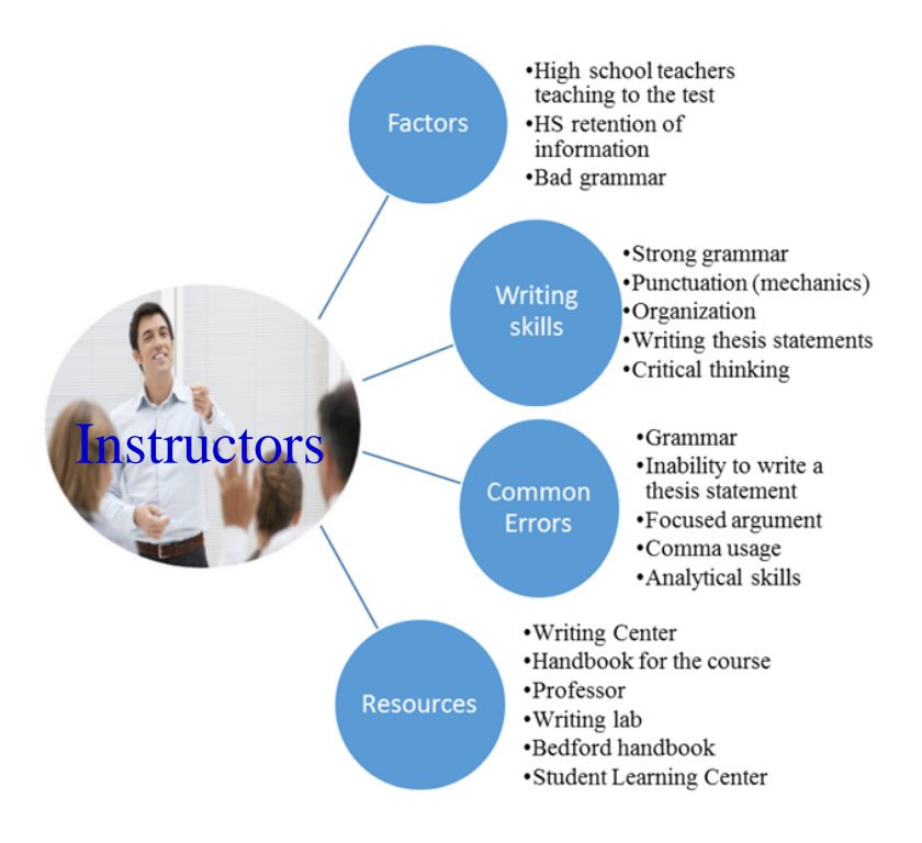
Figure 1. Instructors Concept Map