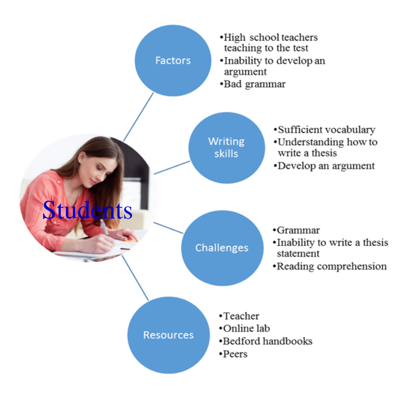
Figure 3. Students Concept Map

After preliminary cataloging of data, color-coding was used within each interview to formally organize, code, and analyze the data. Initially, the coding was accomplished by category of participants followed by an overall analysis and emerging themes from the twelve participants. A separate narrative analysis document was prepared and then merged into this project for an overall analysis summary.