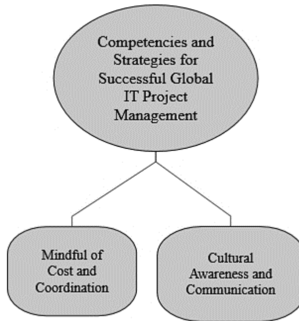
Figure 2. Competencies and strategies for successful global IT project management.

Mindful of cost and coordination. Five (100%) participants noted the importance of being mindful of costs during the management of a global IT project and coordinating the appropriate personnel to work on a global IT project. Coordinating an appropriate work flow for a global IT project is an important strategy for IT PMs to successfully manage a large, global IT project. One (20%) participant talked about coordinating a successful workflow with two teams located on different continents. PM3 explained that because of the time zone differences, when one team would finish their workday the other team would begin their workday. As a result, PM3 created a good cadence of work between the two teams so they were “effectively working 24 hours to identify, fix, resolve bugs and regress against the product we were building.” Being able to manage and coordinate two separate teams to work together helped ensure the