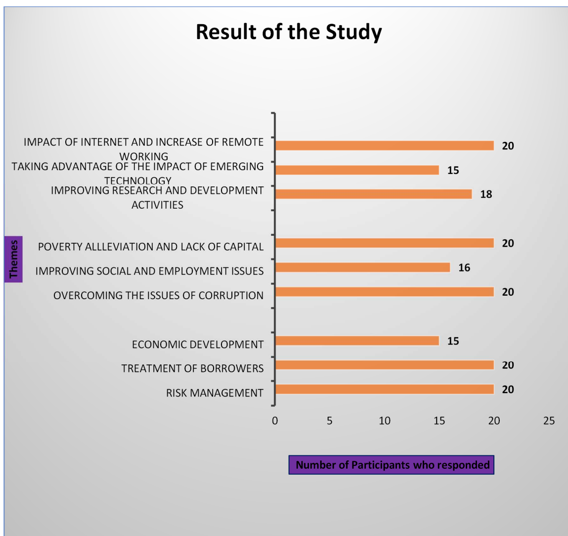
Figure 1. Study results. The results of the study in a chart format showing the themes and number of participants who responded.

The participants in this study have identified some commonalities in their lived experience in poverty alleviation and the quest to raise capital to state business. It seemed that risk management and the treatment of borrowers were the dominant economic components affecting the poverty and the lack of capital generation. For the political element, the issue of corruption and lack of capital were influential to their poverty and