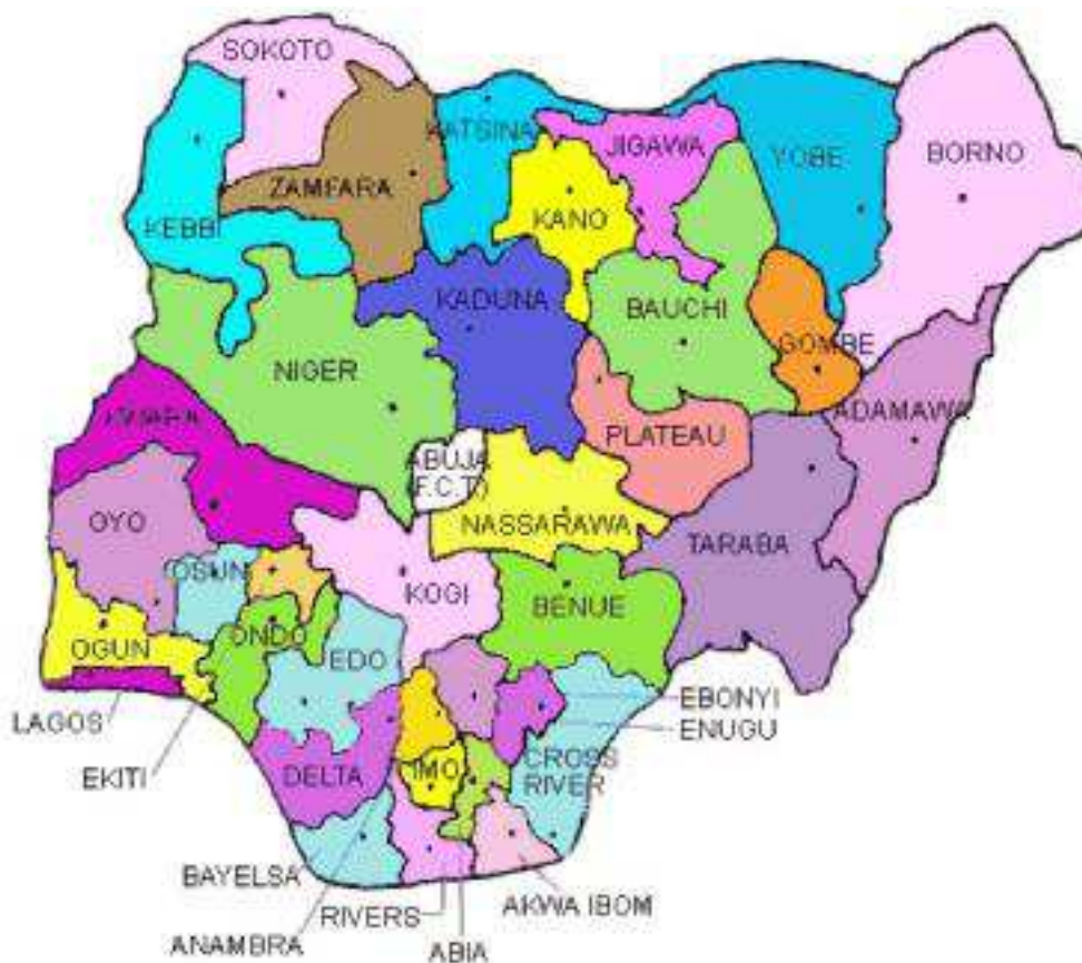
Appendix A: Map of Nigeria Showing 36 states including Lagos State