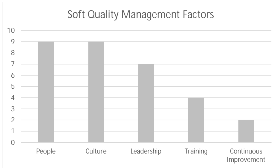
Figure 1. Pareto chart of soft quality management factors adapted from information in Table 4.