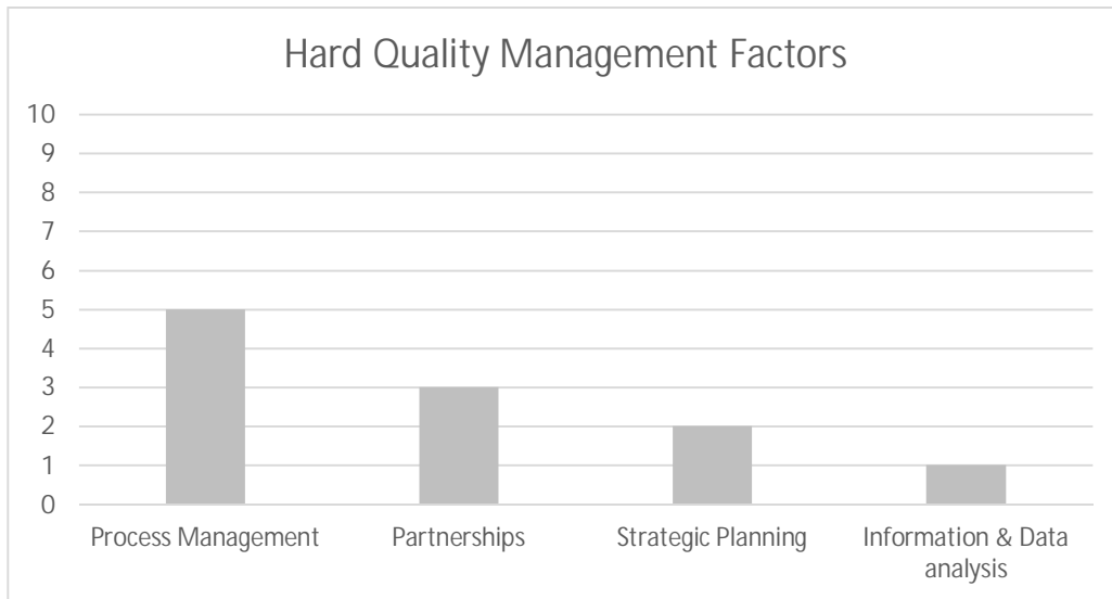
Figure 2. Pareto chart of hard quality management factors adapted from information in Table 4.