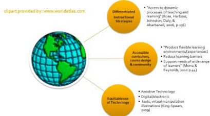
Source: Bart, R. (2012). Universal Design for Learning: Creating an Inclusive Virtual Learning Environment. 38 th Annual Distance Teaching & Learning Conference Proceedings. Retrieved from http://www.uvex.edu/sites/default/files/2012/01/udl_2012.pdf