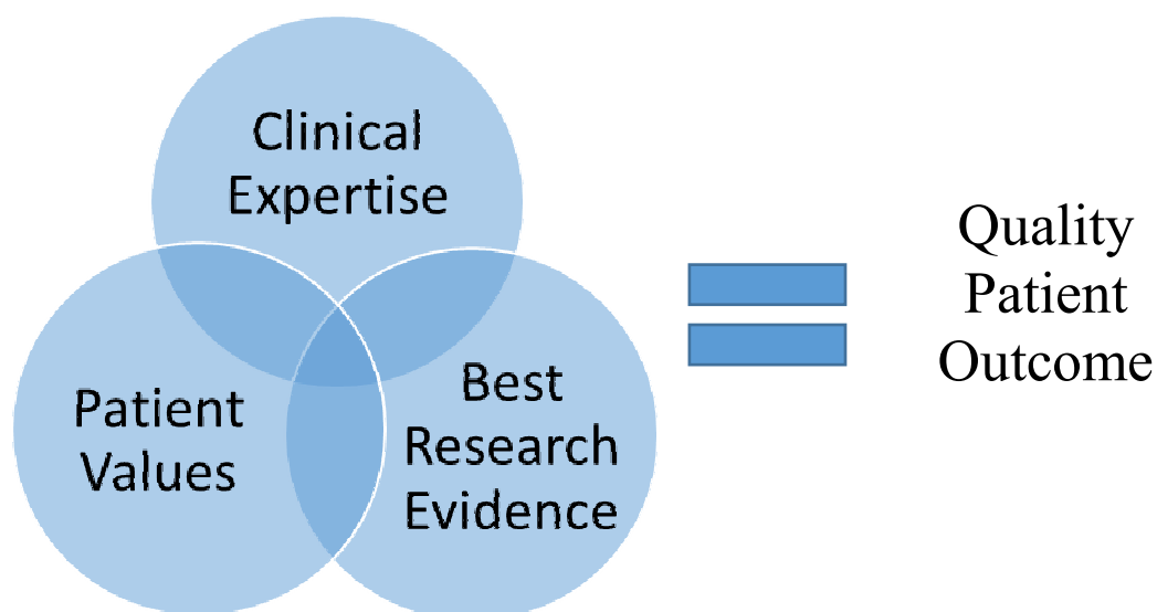
Figure 1: The elements of EBP. (Sackett, et al, 2001).