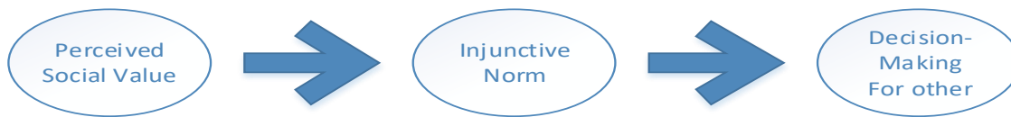
Figure 1. Mechanism for decision-making in social values theory (Dore et al., 2014).

Figure 1 illustrates the mechanism of decision-making proposed by SVT (Dore et al., 2014): the social values underline the process, or the norm referred to as an injunctive norm, and the decision-making process. The surrogate decision-making process for self and others, or self-other after Tunney and Ziegler (2015), was used to explain the parental risk preferences.