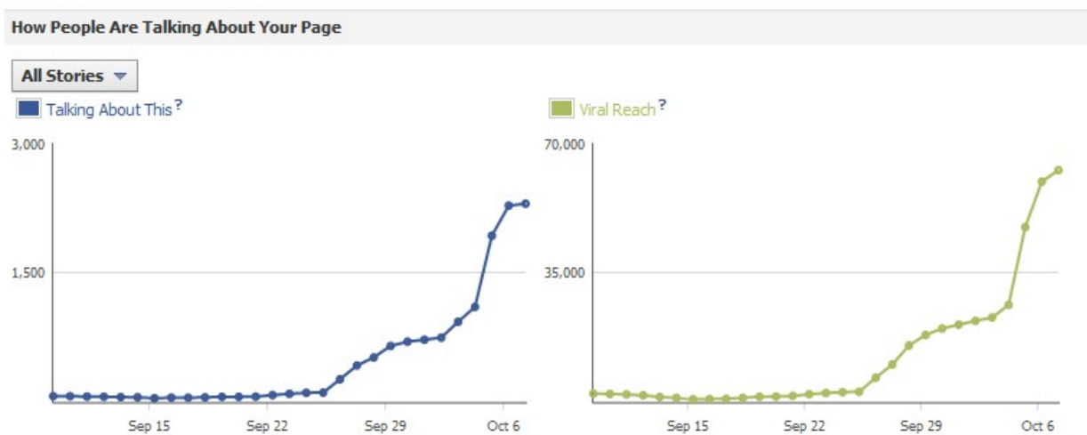
Figure 5. Facebook statistics.

The use of social media greatly contributed to building a global network community around the World Business Forum. To access interaction through this channel, Laureate analyzed the Facebook page traffic for this event. The “How People Are Talking About Your Page” data was calculated based on Facebook interactions that occurred over the seven days immediately prior to the event. This calculation is based on instances of people linking to the page (i.e. becoming a 'fan'), posting to the page’s wall, linking, commenting on, or sharing content (posts, videos, photos, albums, etc.) on the wall/page, answering a question, RSVPing to events, linking or sharing a check-in deal, or checking in at the wall. As showed in figure 5, a substantial increase of traffic on Facebook was observed when the network began promoting the event and during the October 5th and 6th webcast time period.