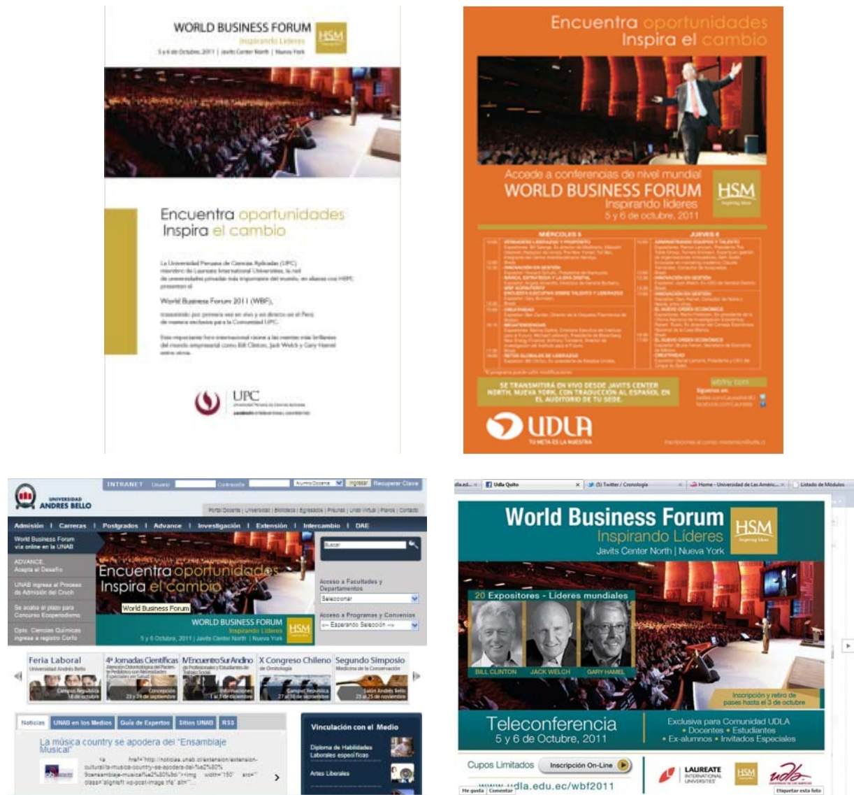
Figure 2. Sample of promotional materials.