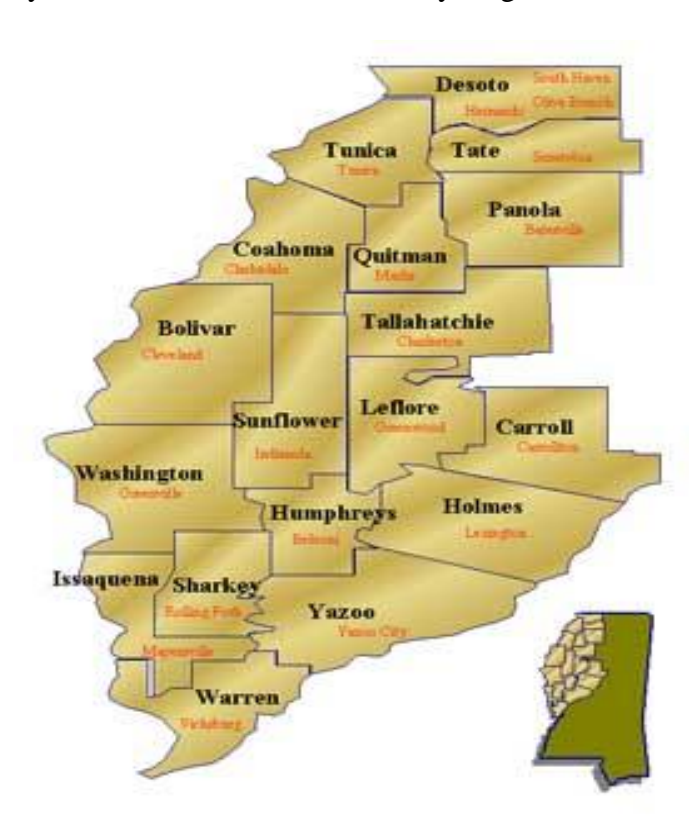
Figure 2. Map illustrating the Mississippi Delta counties where the participants reside and practice.

I chose the study participants from the following counties: Bolivar, Washington, Desoto, Leflore, and Sunflower. Three participants were from outside of the Mississippi Delta due to the small sample population. These participants were from Hinds County and Madison County, which are counties that closely neighbor the Mississippi Delta.