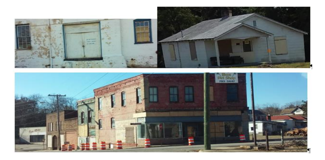
Figure 5. Blighted buildings.

Transportation infrastructure. Looking at a map of Danville, Figure 1, provides a visual reference for the city's awkward, or indirect, highway connections that were referenced by several participants. They noted that there are highways to and from Danville, but they are not major interstates. Connections to large interstate highways (such as I-64 or I-95) from Danville require travel on roads that are, at times, two lanes. Danville is not a port and only has a local airport. Its tobacco and textile industries were supported by railroad lines, which although are still active, have suffered significant decline. Participant 611136 discussed an opportunity for establishment of a distribution center in the region. Danville-Pittsylvania County was a finalist but lost to a location in North Carolina because it "is on the interstate and we're not."