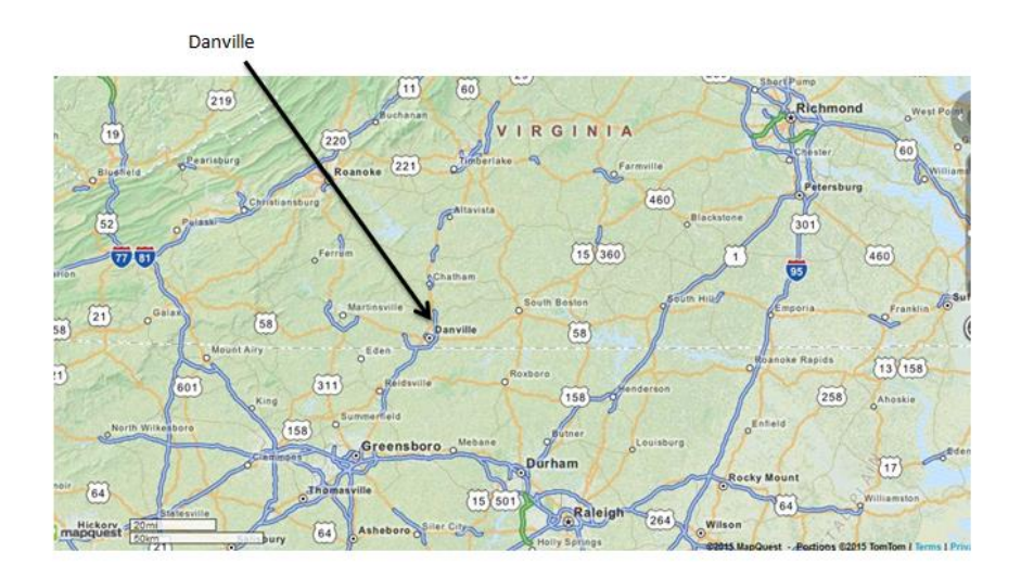
Figure 1. Danville, Virginia, area map.

economic decline, significant issues with poverty and unemployment, and has active economic and community development programs. Danville is located in a rural area with mulitple urban areas relatively distant in most directions. It is 45 miles from Greensboro, NC; 56 miles from Durham, NC; 144 miles from Richmond, VA; 73 miles from Roanoke, VA; and 65 miles from Charlottesville, VA. See Figure 1 for the location of Danville, VA, relative to the nearest metropolitan areas.