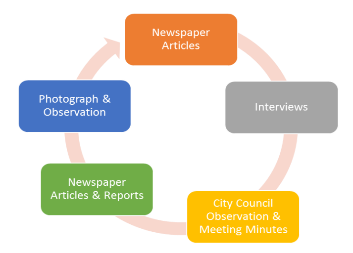
Figure 2. Cycle of data collection.

buildings and area prior to renovation). My observations were documented through photographs made concurrently with the observation. Specific care was taken to avoid the potential bias that comes with the role of a participant-observer and to remain objective without endorsing a particular viewpoint (Yin, 2014). Although observation requires the researcher to be in the community and walking through parts of the community, interaction with city residents was not part of my research since the study is focused on policymaking, rather than community perception.