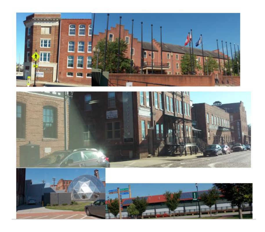
Figure 7. Bridge Street, The River District, Danville, Virginia. Top left is the former Dan River R&D building undergoing rehabilitation into an orthopedic medical center. Top right is a former tobacco warehouse now occupied by the Danville Regional Foundation and Averett University's School of Nursing. Center photos show warehouses converted to lofts and the restored cobblestone street. Bottom left is the Danville Science Center. Bottom right is the Community Market, which also serves as an event venue.

Some success, making progress. Participant 618139 explained that the economic condition had been severe, so it takes a while to recover; however, many policies and programs are paying off. The city is more attractive with blighted properties being removed. Streetscape efforts are changing the face of downtown, and people are starting to move in instead of out of Danville. Participant 611122 noted that Danville is an affordable place to live with nice amenities and a good quality of life; there are