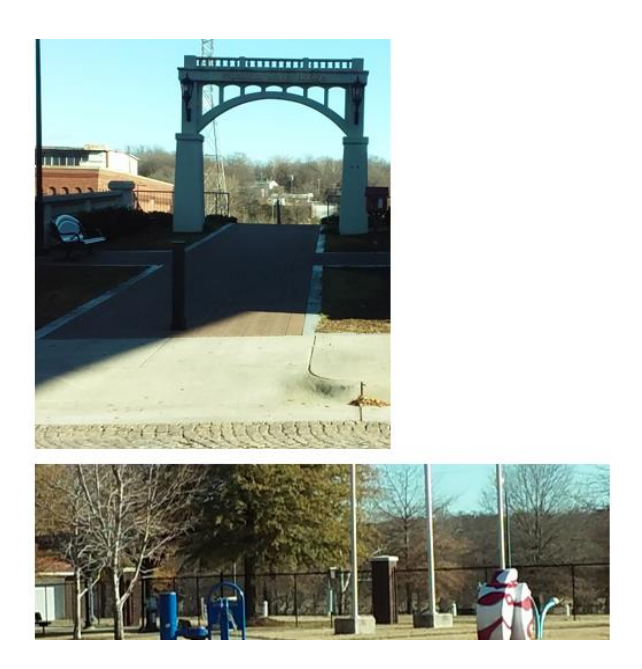
Figure 6. Riverwalk entrances from the river district.

Industrial parks. Through partnerships, Danville has designated and developed four industrial parks in and near the city that house major entities, such as IKEA and the Institute for Advanced Learning and Research (P617123). The industrial parks enable the city to offer ground-up opportunity locations, or shell buildings, that can be custom finished to accommodate the business, as was done with Nestle (P611122). Because there are several locations/parks with varying options for building, the city has flexibility to accommodate the needs of businesses interested in expanding or locating in the area.