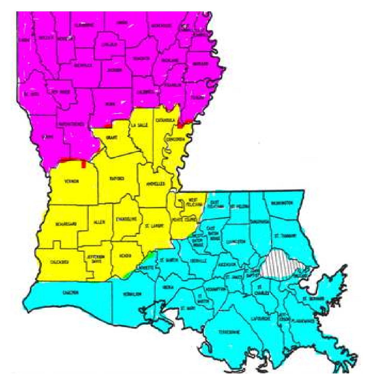
Figure 1 . Regional demographic map of Louisiana. From "Louisiana—Parish Map," by WorldAtlas, 2017 (http://www.worldatlas.com/webimage/countrys/namerica/usstates /counties/lacountymap.htm). Copyright 2017 by WorldAtlas.com. Permission Granted