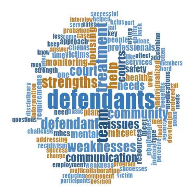
Appendix C: Written Interview Results