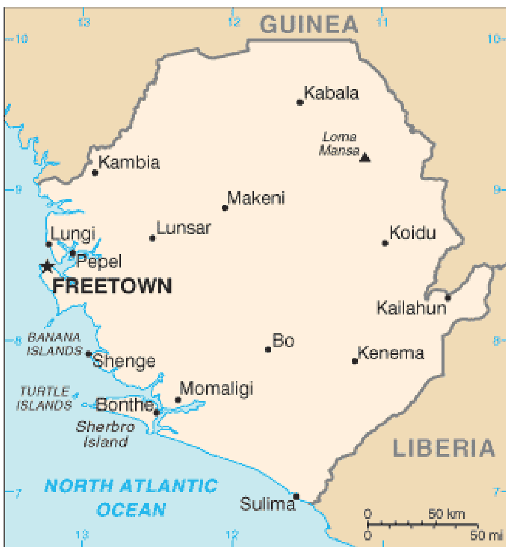
Appendix E: Map of Sierra Leone