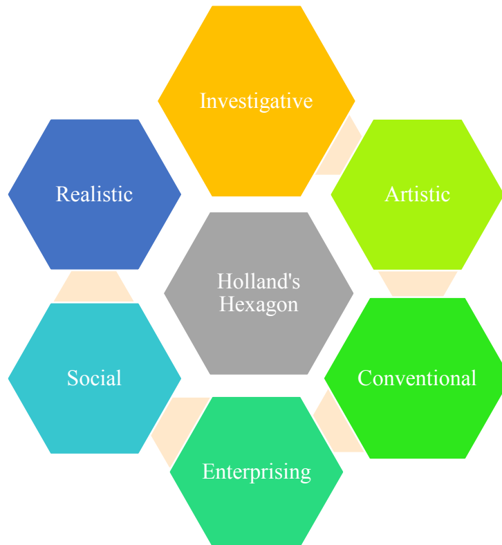
Figure 1. John Holland's hexagon.

These personality types are a result of a combination of biological, cultural, and social influences which lead to different competencies and interests that help shape how people perceive, think, and behave. The second postulation asserts there are six matching work and academic environments which are characterized by a population whose characteristics resemble the six model environments stated earlier: Realistic, Investigative, Artistic, Social, Enterprising, and Conventional (Holland, 1985; 1997).