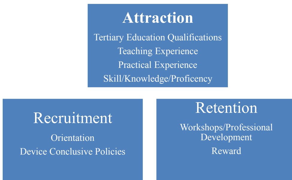
Figure 4. Recommendations at a glance.

following were gathered from the study as recommendations from the department chairs and faculty face-to-face interviews (see Figure 4).