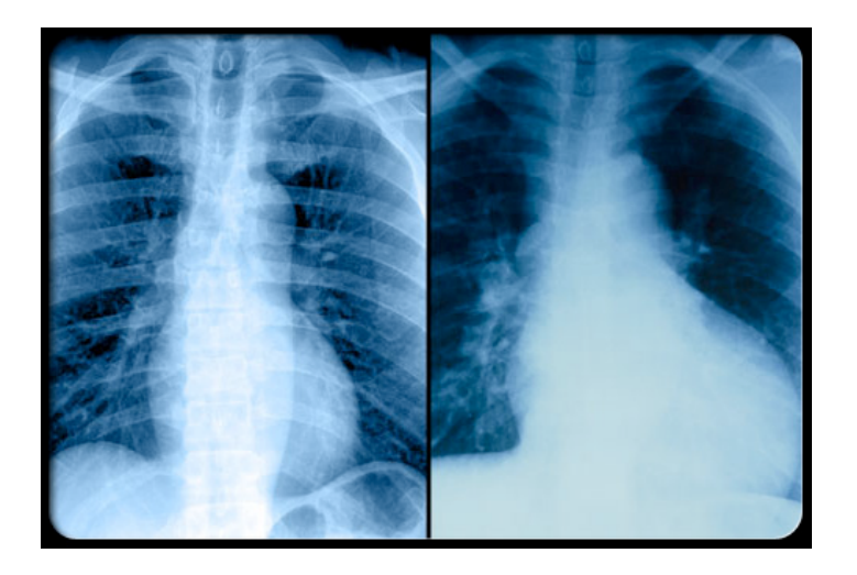
Figure 2. Normal heart on the left and a heart with congestive heart failure on the right.

weakness, pulmonary edema (fluid in the lungs), and changes within vital signs (Lewis, 2014). An X-ray view of a normal heart is on the left of Figure 2 a CHF heart is on the right.