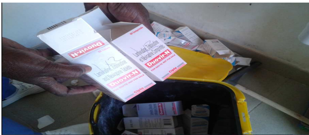
Figure 2. Patient throwing second-line ART.

P6, P9 and P10 emphasized that there should be a continuous and supportive adherence counselling for people on ART medication in order to reduce issues on lost to follow up, drug resistance, morbidity and mortality among HIV patients. In relation to ART medication adherence, some participants had clarified that;