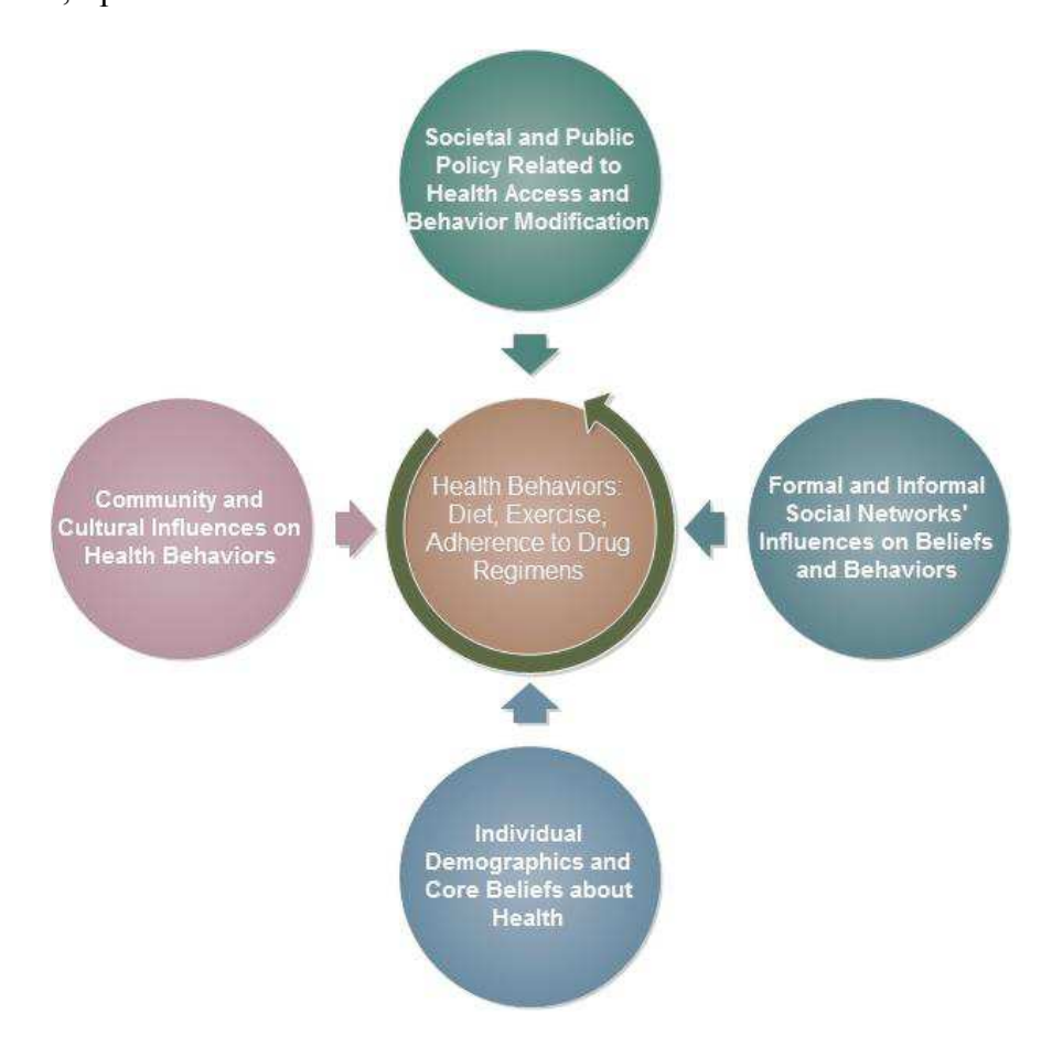
Figure 2. Based on Bronfenbrenner theories of the ecological influences on health behaviors (Retrieved from public domain, published for public use, no permission required).

the social context will produce changes in individuals, and affirms that the support of individuals in the population is essential for implementing environmental changes (McLeroy et al. 1998). This conceptual framework places significant emphasis on interventions aimed at changing interpersonal, organizational, community, public policy, and personal factors (Bentley et al., 2013; Ganz et al., 2002, & McLeroy et al., 1998). In Figure 2, I presented a model of SEMH.