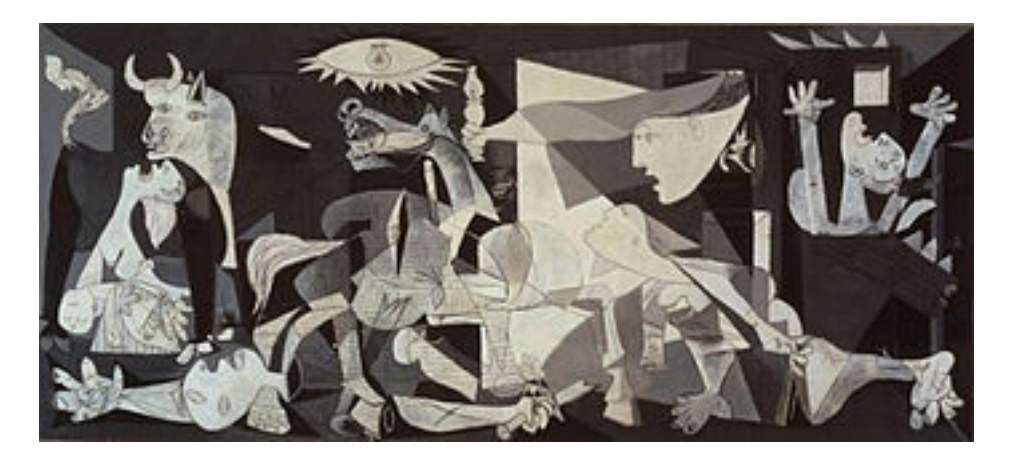
Figure 4. Guernica. Pablo Picasso, 1937. Museo Reina Sophia, Madrid.

Within digital humanities, technology can deliver epiphanies as when art is viewed on a smartphone and the viewer's intelligence and emotions roam the "neural patterns of our mind" (Loprieato, 2014, p. 424), producing aha moments in explosive neuroaesthetics. Be they synchronous and asynchronous, digital humanities can encourage independence and collaboration and can create more global connectivity and reciprocity, making the area of art and technology worthy of future research. Art can