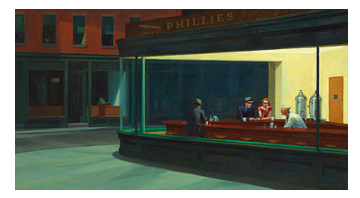
Figure 5. Nighthawks. Edward Hopper, 1942. Art Institute of Chicago. Chicago, Illinois.

education: the gap between White and affluent students and students of color and those in poverty. Technology employed in learning, now termed elearning, has the potential to narrow this gap. Therefore, the merger of art with technology can be a great social equalizer. The opportunity for an optimal experience becomes available to all. For example, imagine what will happen when an institution makes Edward Hopper's Night Hawks (Figure 5) available to all people at all hours; viewers will reflect on their own identity and on the collective unconscious that provides a portrait of Americans.