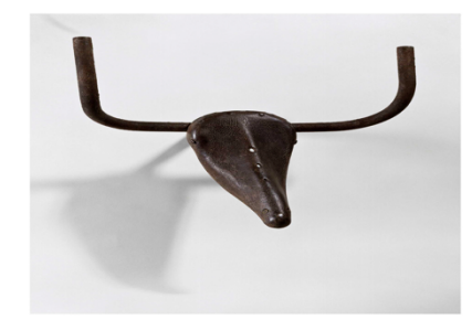
Figure 2. Pablo Picasso, Bull's Head, 1942, Collection Mesée Picasso, Paris.

In slowing down perception, viewers develop both critical and creative thinking that contributes something more than viewing another piece of art. Looking to know and feel, or sense-data, becomes seeing with perception. Dewey (1934) encouraged (a) active learning of seeing, (b) talking about the qualities of art, (c) understanding the historical and cultural context in which art is created, and (d) questioning the aesthetics and justification of the value and function of art. Dewey's process of aesthetic analysis would be considered the total human experience had he included emotions. Dewey elaborated on sensory aspects in relation to psychology and emotions in support of reasoning in a balanced person, the operative nuances being "supportive of reasoning" and "balanced" (p. 247).