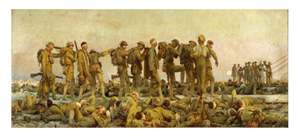
Figure 3. Gasssed. John Singer Sargent, 1919. Imperial War Museum, London.

humans to positive social change in showing them the past and present so they can design an improved future.