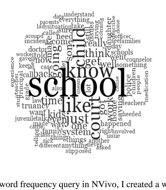
Figure 4. Conducting a word frequency query in NVivo, I created a word cloud using 100 frequently used words based on a minimum of three exact matches in case interview sources.