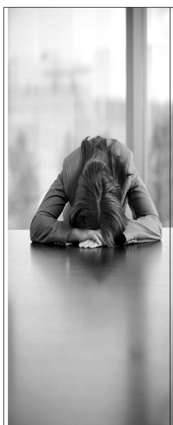
Appendix D: Participant Recruitment Flyer