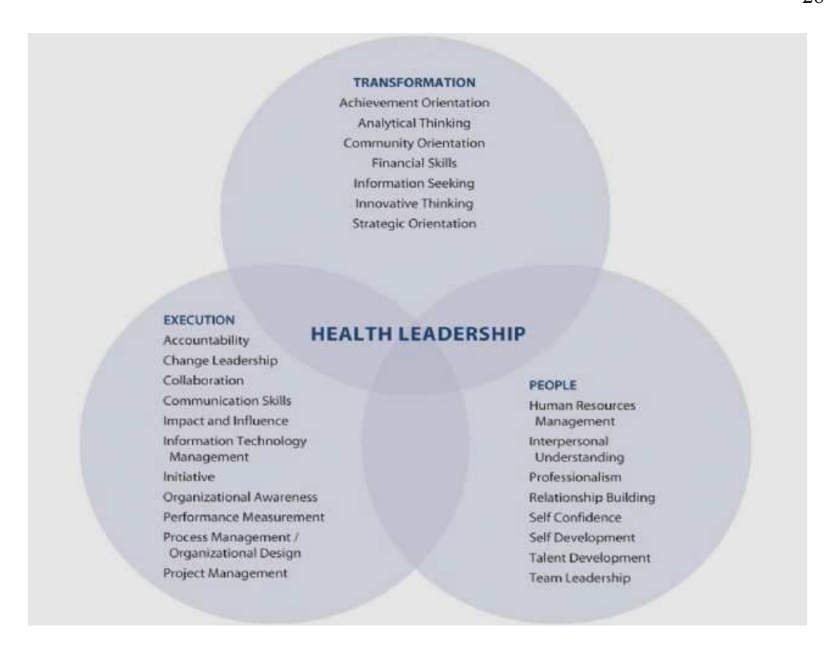
Figure 1. From The National Center for Healthcare leadership model , by the National Center for Healthcare Leadership, 2014a.

The model was developed and validated using interdisciplinary subject matter experts, and then refined by educational psychologists (NCHL, 2011). The need for advanced improvement in American healthcare was documented in the first two Institute of Medicine watershed reports in 1999 and 2001 (Calhoun et al., 2012). The third Institute of Medicine report in 2003, stressed the goal of enhancing quality of care in the United States could not be accomplished without the reforming of education and professional development across the health professions (Calhoun et al., 2012). Also addressed in the 2005 Joint Commission white paper, competency, or outcome-based