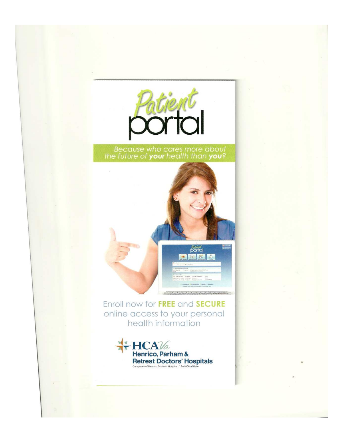
Appendix A: Educational Material