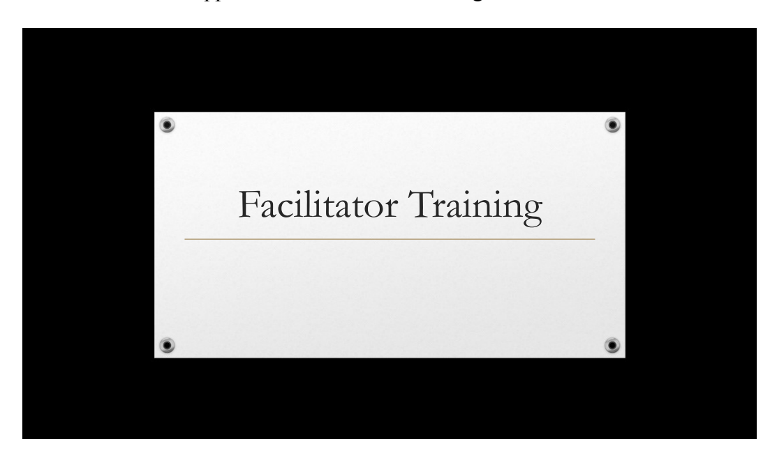
Appendix G: Facilitator Training PowerPoint