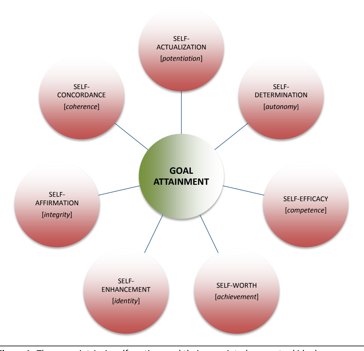
Figure 1: The seven intrinsic self-motives and their associated conceptual ideals.